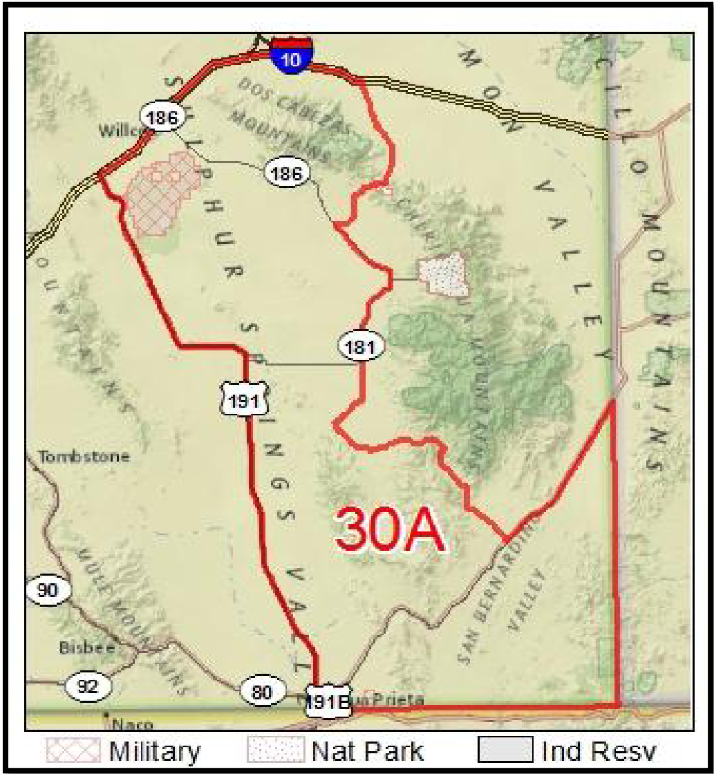
Figure 2. State Hunting Unit 30A